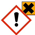
Irritating / Harmful