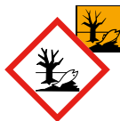
Dangerous for the environment